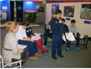
Izmir SEV Elementary School