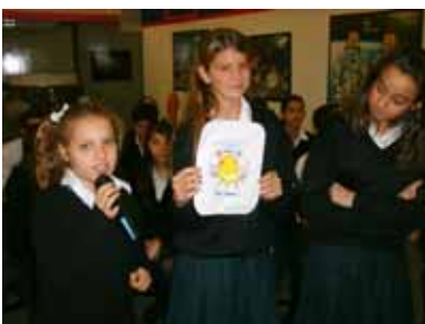
Izmir Turk College