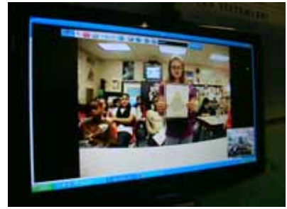
Hobgood NASA Explorer School