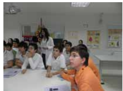
Atakent Doga College