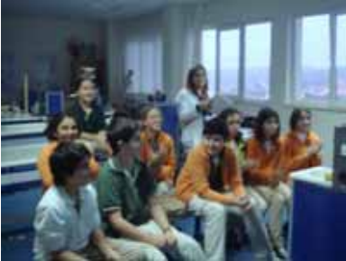
Sariyer Doga College