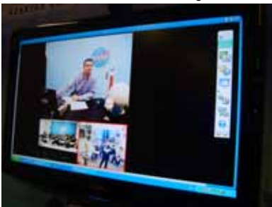
NASA and PLISM School