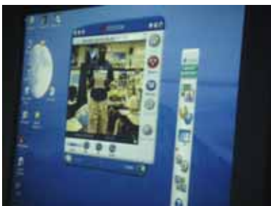
Hobgood NASA Explorer School